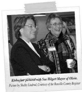
Klobuchar pictured with Sue Hilgert Mayor of Olivia.

Senator Klobuchar visited with Renville County locals at Master's Coffee Shop and Bakery in Olivia on January 14th.